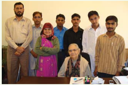
CDC students at an Award Ceremony at the SEF after successfully passing their matriculation exam