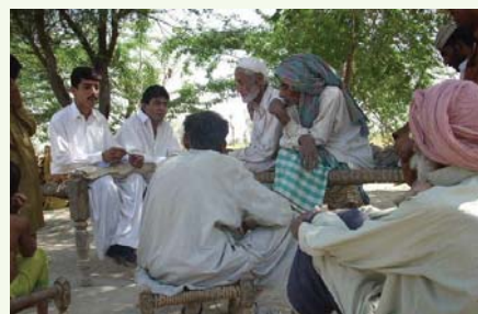
Community members and SEF team discussing school improvement plan