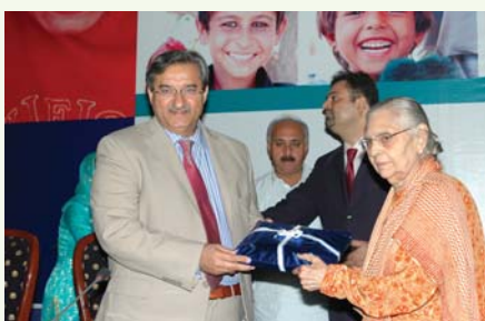
Hon'ble Senior Minister for Education at the Launch of Early Learning Program