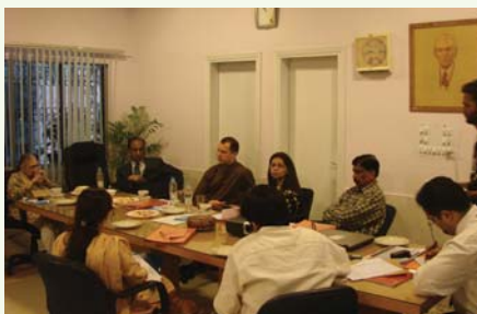
Meeting of PPRS Project Steering Committee, being held at SEF in 2009