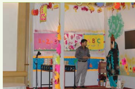
SEF's Learning Support Unit demonstrating an ECD classroom environment at launch of Early Learning Program