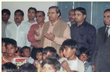
Hon'ble Pir Mazhar ul Haq (Senior Minister, Education & Literacy, GoS) visiting one of the SEF Partner Schools in Sindh