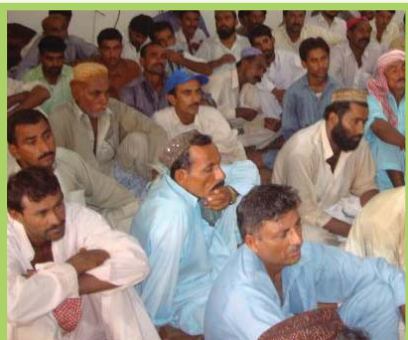
Members and Teachers of RBCS project sitting in meeting

reaches out to marginalized children that have either dropped out or never attended school. New Century Education curriculum has been adopted in the 250 project schools which will impart primary level proficiency to students in a three year