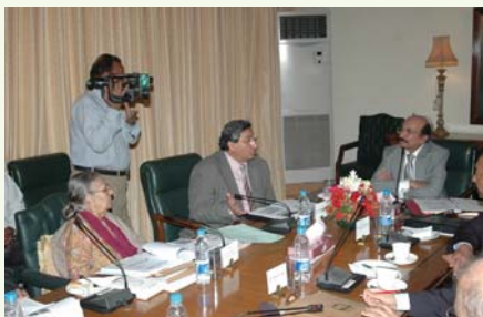
MD, SEF briefing the Hon'ble Qaim Ali Shah (Chief Minister, Sindh) and Hon'ble Senior Minister for Education, Pir Mazhar-ul-Haq about SEF activities