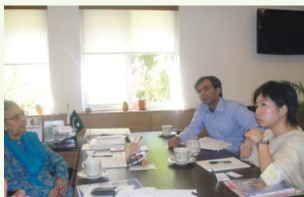
Delegation from JICA in a meeting with MD, SEF