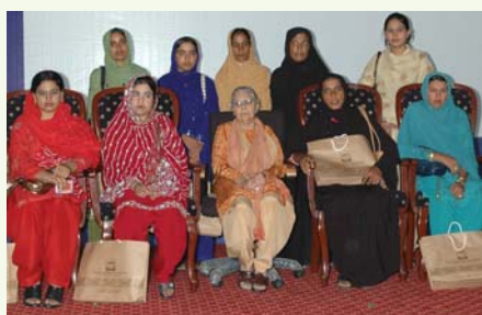
Teachers from SEF Partner Schools attending SEF advocacy event in Karachi