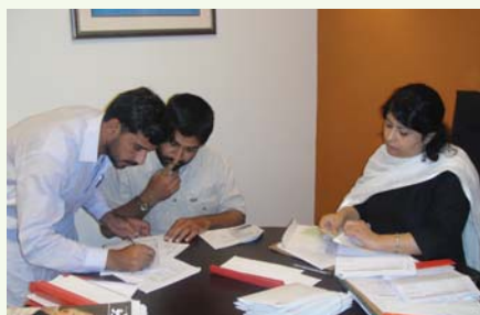
PPRS school entrepreneurs receiving fee-subsidies at SEF Head Office in Karachi