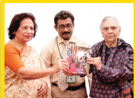
SEF launches a new reader developed by SEF Program Advisor for adult education