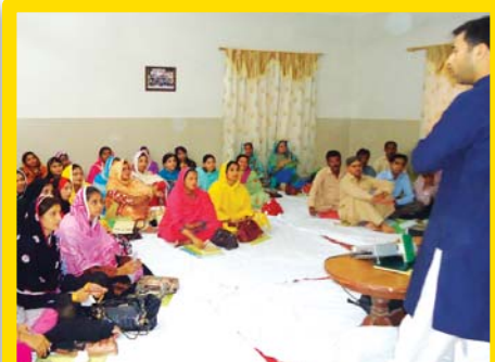
Partner school teachers attend training on child-centered pedagogy and effective assessment techniques