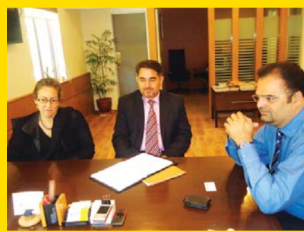
Representatives share focus of USAID education programs during a meeting at SEF