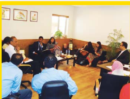
World Bank Mission and SEF during a meeting at the SEF Head Office