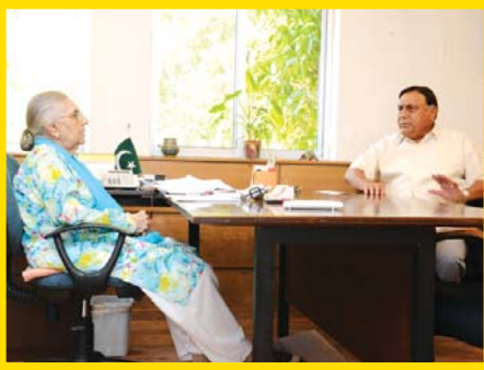
General Moinudeen Haider, Ex-Governor Sindh, discussing school adoption with MD SEF