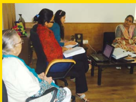
SEF Project Coordinators present progress during review meetings with Senior Management