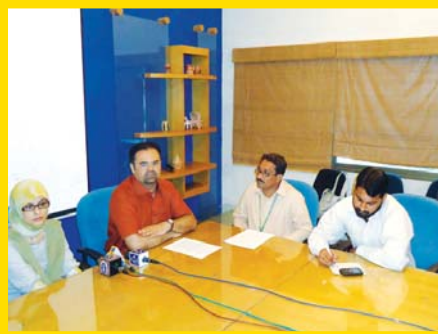
SEF conducts press briefing to announce the launch of the third phase of PPRS Project