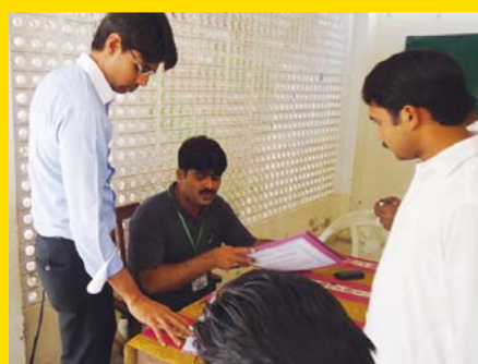
Program team during an assessment visit to a partner school in Khairpur