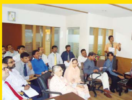
SEF Regional Coordinators brief Senior Management on efforts towards flood relief in school communities