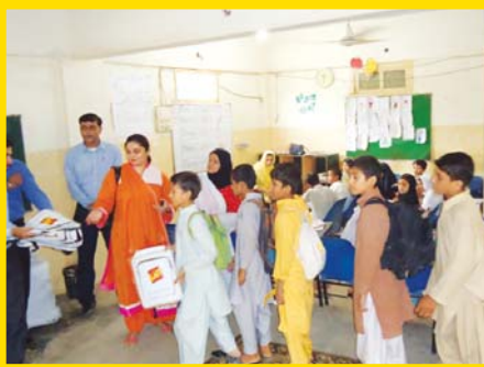
Working children at SEF's Child Development Center receive school bags from Mobilink representatives