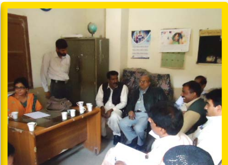
Stakeholders discuss details of school adoption at a meeting organized by Adopt-a-School Program