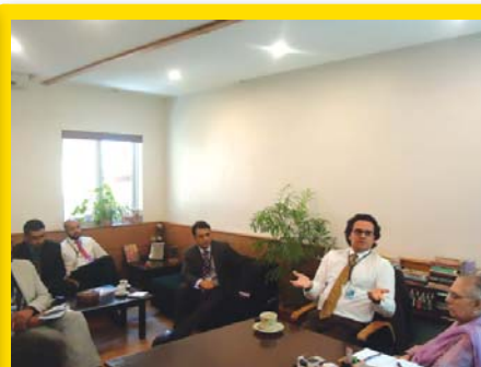
The British Council team in a meeting at the SEF Head Office