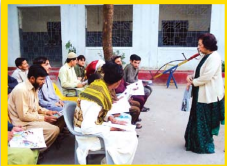
SEF's Program Advisor carries out pre-testing of the beginners resource developed for adult literacy