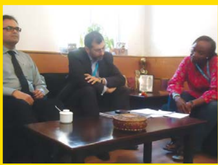
Representatives from UNICEF share details of their community radio programme for girls' education