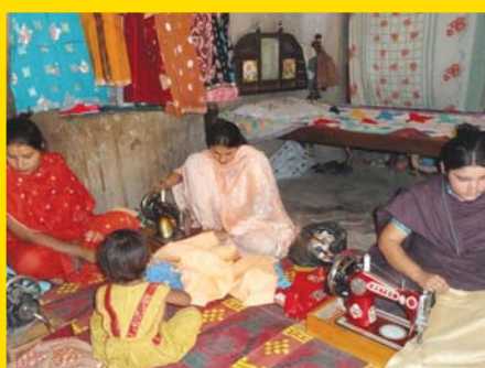
Vocational classes for adult learners underway at the Women's Literacy & Empowerment Center in Malir