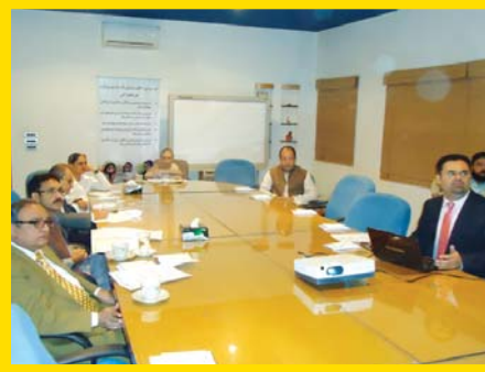
SEF Management presenting updates to the Executive Committee