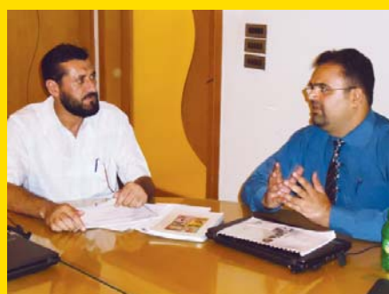
Director SEF discusses educational interventions for working children during a review meeting