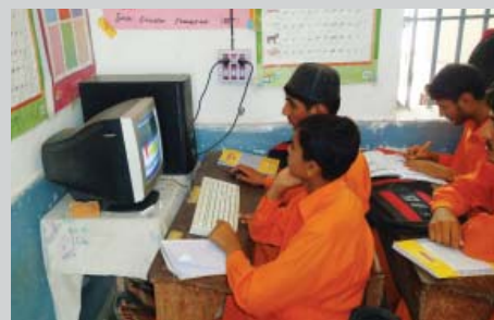
Mr. Ayaz Soomro (Minister for Law & Prisons, Government of Sindh) inaugurates the educational facility in Sukkur Jail