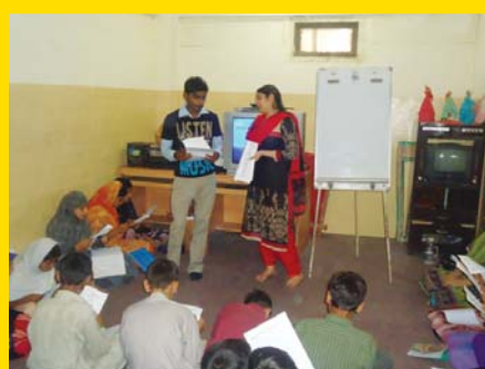
SEF staff conducting English language classes for working children