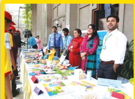
SEF publications and resources displayed in Lahore at the Children's Literature Festival