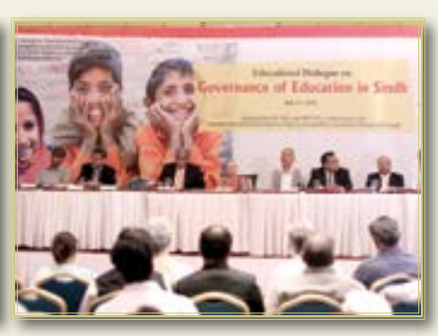
Distinguished panelists talking on challenges faced in educational governance in Sindh