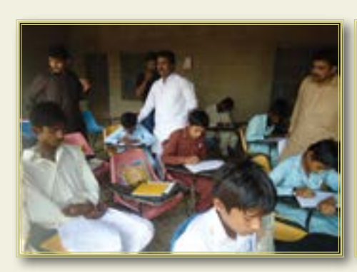
SEF staff on a school support visit to a RBCS School