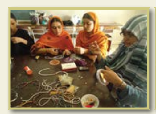
Income generation skill training for women organized by WLEP in collaboration with Rangoonwala Community Center