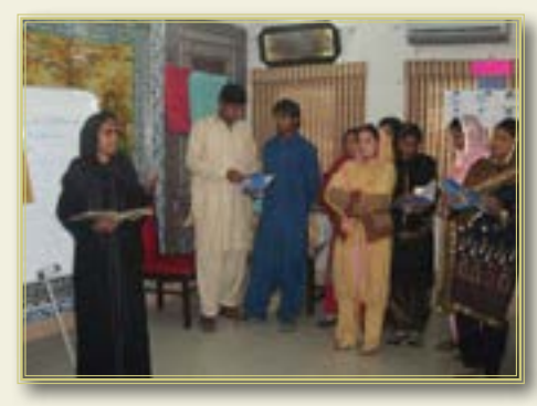
Training in progress to enhance subject based competencies of PPRS Teachers