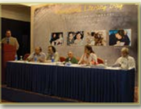
Expert panelists discussing the state of literacy and education in the country