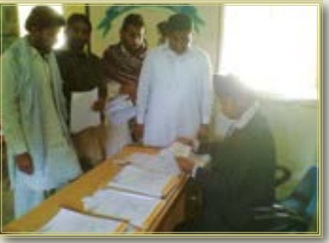
Contract signing and salary distribution activity by SEF for ELP teachers