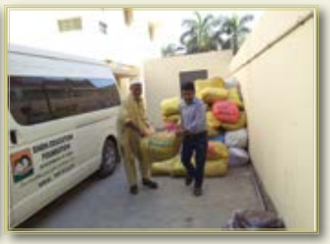
Dissemination of school bags to IELP school children underway