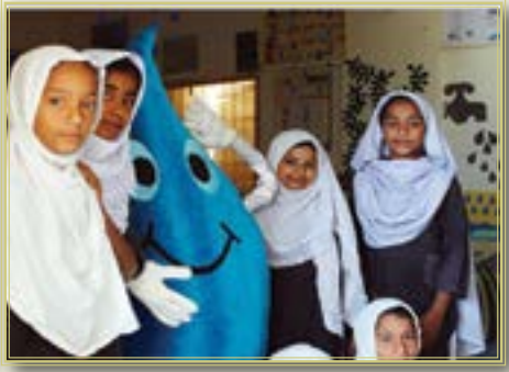
SEF students participate in the Global Hand-Washing day