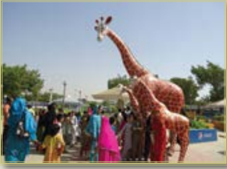
CDC children on a visit to Safari park, Karachi