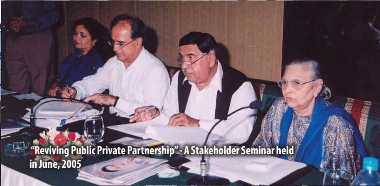
'Reviving Public Private Partnership' - A Stakeholder Seminar held in June, 2005