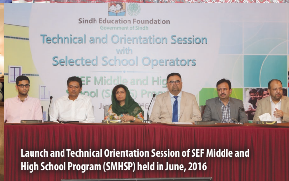
Launch and Technical Orientation Session of SEF Middle and High School Program (SMHSP) held in June, 2016