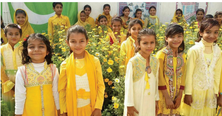
Yellow day celebrated by Azad Public School (SAS) Bhiria Road, District Naushahro Feroz