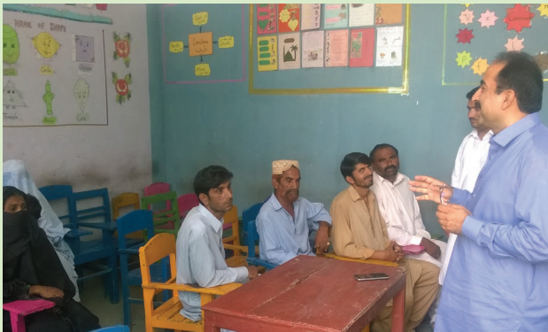
Meeting with Stakeholders Conducted by Deputy Director, Larkana Region

Foundation’s Regional Offices have gradually strengthened in terms of manpower and systems and their interaction with schools for various supporting activities is now beginning to reflect upon school improvements. The Larkana Regional team remained highly proactive especially in terms of improving communication between the stakeholders particularly the School Partners and the Communities. The Region organized a range of mediation sessions on ground to resolve issues which were impeding school progress. Another major progress attained was systematic follow -up on post teachers and head teachers training to facilitate greater role of head teachers in the schools. Continuous visits and liaison with school partners has helped in improving infrastructure; installation of solar systems in schools; improving Student-Teacher ratios and Student-Classroom ratios etc.