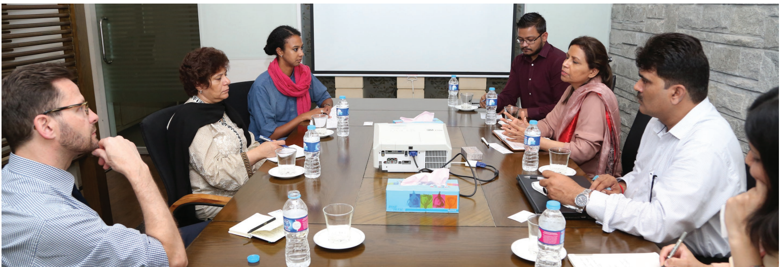
Managing Director-SEF's brief meeting with Department for International Development (DfID) on March 08, 2017