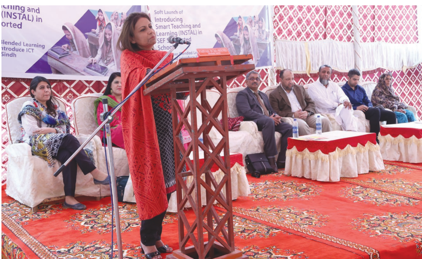
Pilot Launch Ceremony of INSTAL in Malir District, Karachi in February, 2017

Under Phase II of the SEF Middle and High School (SMHS); Foundation selected 47 partners for setting up 65 Middle/High Schools in areas not having the facilities for post primary education. These were selected from over 900 applications.