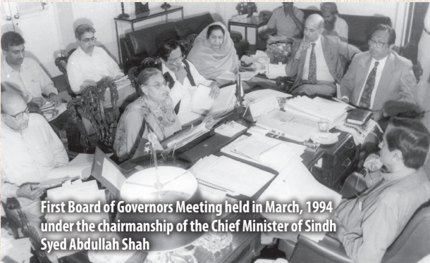
First Board of Governors Meeting held in March, 1994 under the chairmanship of the Chief Minister of Sindh Syed Abdullah Shah