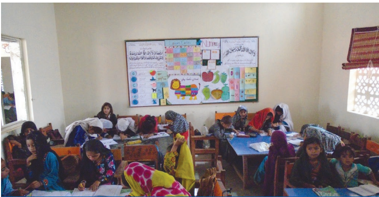
Resourceful ECE classroom depicted in Indus Valley Public School, Sehwan Shareef - PPRS Phase VI