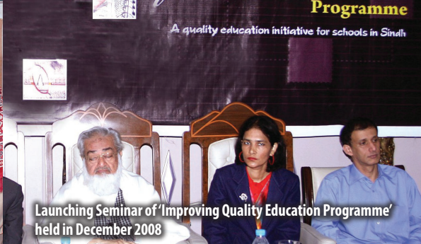
Launching Seminar of 'Improving Quality Education Programme' held in December 2008