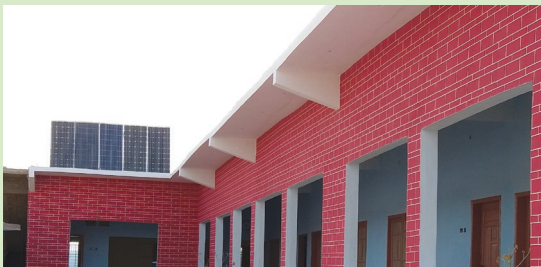
Solar Panel installed in Dr. Qadeer Elementary Public School, Dur Muhammad, PPRS VI, Dadu