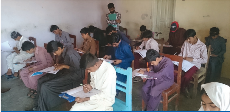
Assessment 2017 of grade III to VII of PPRS Phase I to IV