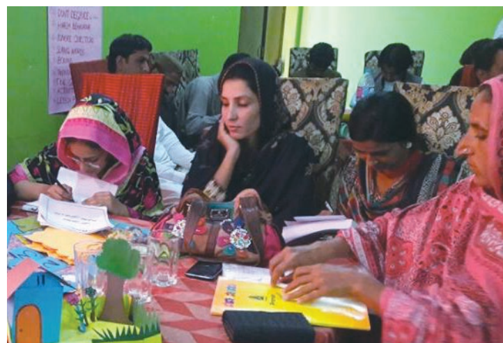
ECE Practitioners' Engagement in Capacity Building Session

The ECE training was aimed at broadening teachers' concepts, with emphasis on classroom environment, effective lesson planning and essentials of micro teaching. In addition, key concepts of subjects such as English, Mathematics, Science and General Knowledge were also incorporated into the training schedule. In alignment with this, two day session was specifically given to head teachers to facilitate School Action Plan for improving classroom observations and academic planning etc. On the last day of the training, the Managing Director of Foundation met with all participants and solicited feedback from them.