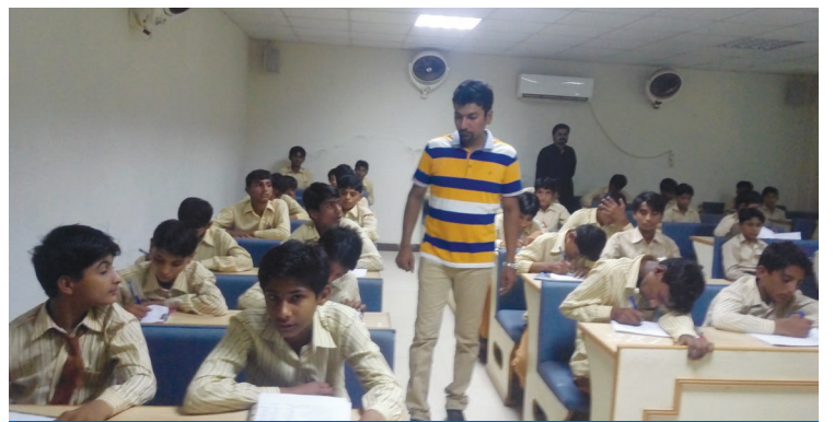
Entry test under A.Q. Khan Scholarship was conducted at Mehran University Campus, Sukkur