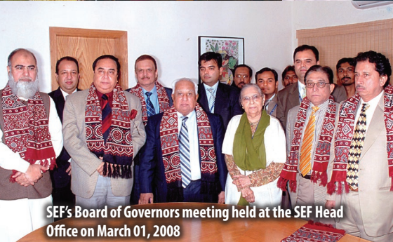
SEF's Board of Governors meeting held at the SEF Head Office on March 01, 2008