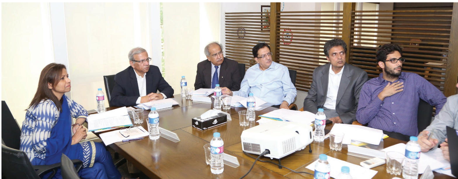
SEF's 3rd Executive & Finance Committee Meeting at SEF Head Office in February, 2017