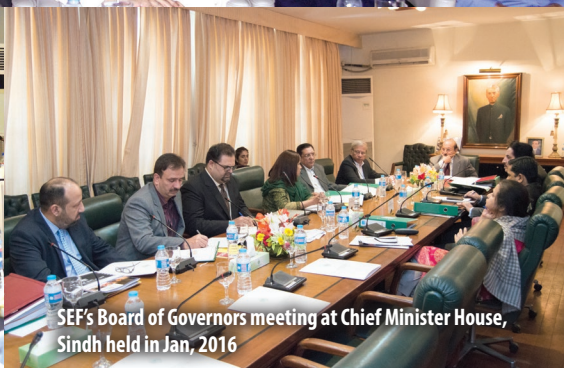
SEF's Board of Governors meeting at Chief Minister House, Sindh held in Jan, 2016