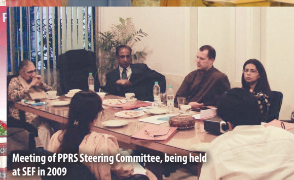
Meeting of PPRS Steering Committee, being held at SEF in 2009

More recently, SEF has initiated systematic efforts to reform the conventional teaching methodology and introduced