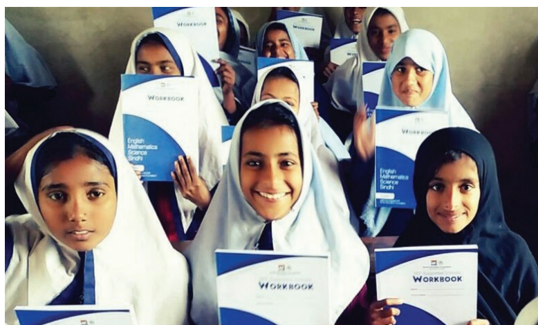
Happy Gestures of Children while Receiving Workbooks

The Foundation's Learning Support Unit prepared ECE and primary grade workbooks with a view to provide supplemental learning materials in schools. These were prepared in major subjects of English, Mathematics & Science. The Foundation initiated workbooks considering many factors. For instance, through workbooks, the taught lesson can immediately be put into use. Moreover, workbooks can break the monotony of the routine lecture method. It also involves learners in an active way so the interest level goes very high. This makes the atmosphere of the classroom more motivating, free of learner's anxiety, and communicative, which are some very essential things in SEF classrooms.