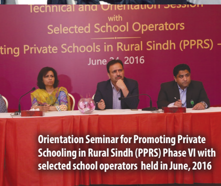
Orientation Seminar for Promoting Private Schooling in Rural Sindh (PPRS) Phase VI with selected school operators held in June, 2016