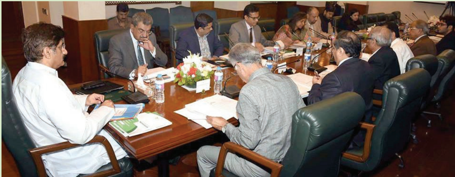
Hon'ble Chief Minister Sindh, Syed Murad Ali Shah presides SEF's 8th Board of Governors Meeting at Chief Minister's Secretariat, Karachi in May, 2017

The 8th meeting of the Board of Governors was held in the Chief Minister's Secretariat under the chairmanship of the Chief Minister, Syed Murad Ali Shah on May 11, 2017. The Board was presented with updates on various on-going activities, especially the strategic interventions of ICT based learning through INSTAL and the implementation of Teach for Change in schools.