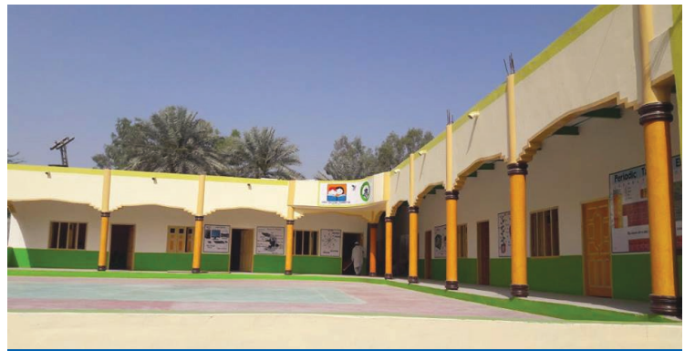
Khushi Public High School, one of the purpose-built schools established under SEF Middle and High School Program (SMHSP), in village Abul Shah, Kingri, Khairpur Mir's