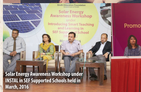
Solar Energy Awareness Workshop under INSTAL in SEF Supported Schools held in March, 2016

The Foundation works as a team under the supervision of the Board of Governors; the Government of Sindh and with its dedicated group of employees; its school partners; students; teachers; parents; communities; service providing organizations; international donors and academia; who were, are and will remain together to continue this journey.