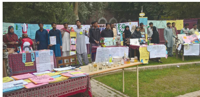
PPRS Teachers Participation in Training Hosted by Beaconhouse School System