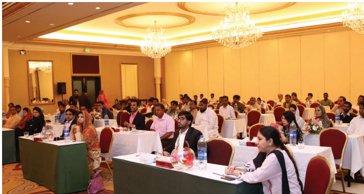
Roundtable Discussion with SAS and PPRS Partners in February, 2017

The Foundation has set some procedures to get first-hand information on practice and performance of schools. In this regard, three days roundtable discussions were arranged with 274 operators and head teachers of PPRS and SAS schools with the objective to review the current status of schools, to gauge the progression, to identify a way forward and strengthening the monitoring and assessment system. The panelist including SEF senior management, Learning Support Unit as well as representatives from Beaconhouse School System. The panelist thoroughly discussed on each component of school and gave recommendations for further improvement on overall school environment, supplementing teaching with technology, and availability of sports ground. The sessions was continued for three days, from February 20 to 22, 2017.