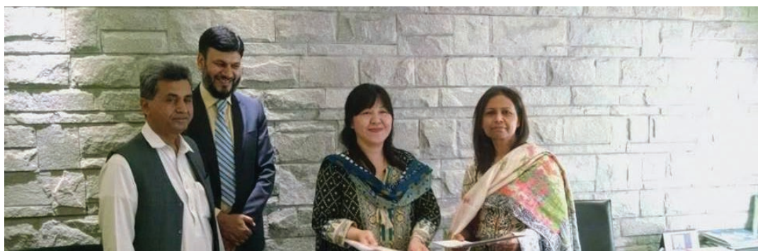
Japan International Cooperation Agency (JICA) Signed MoU with SEF

The Foundation and the Japan International Cooperation Agency (JICA) signed a Letter of Understanding, facilitating the Foundation for utilization of JICA developed NFE curriculum in the newly begun AALTP program. Under this, JICA provided 5,000 complimentary copies of the JICA-NFBE curriculum (Package A & B) to the Foundation. These have been delivered to SEF Partners under AALTP in Karachi.