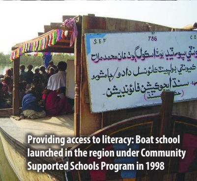
Providing access to literacy: Boat school launched in the region under Community Supported Schools Program in 1998