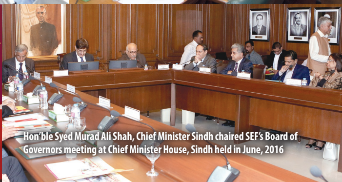
Hon'ble Syed Murad Ali Shah, Chief Minister Sindh chaired SEF's Board of Governors meeting at Chief Minister House, Sindh held in June, 2016