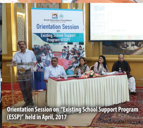
Orientation Session on 'Existing School Support Program (ESSP)' held in April, 2017