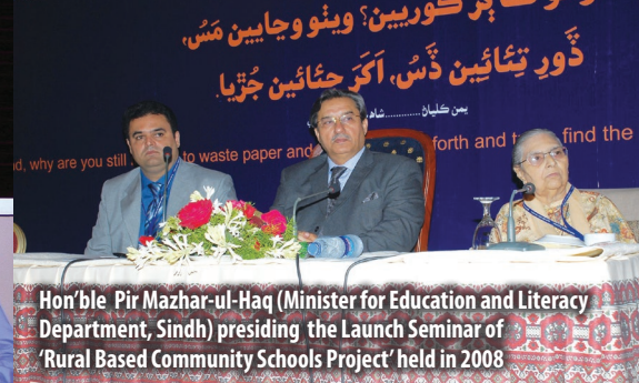
Hon'ble Pir Mazhar-ul-Haq (Minister for Education and Literacy Department, Sindh) presiding the Launch Seminar of 'Rural Based Community Schools Project' held in 2008