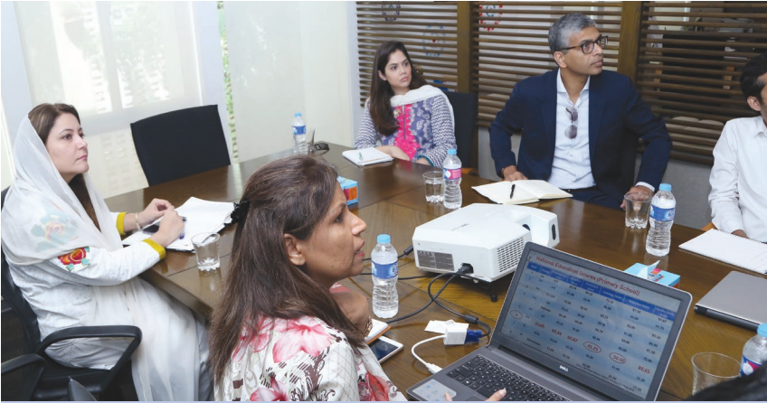
Delegation of Bill and Melinda Gates met with SEF Management on March 08, 2017