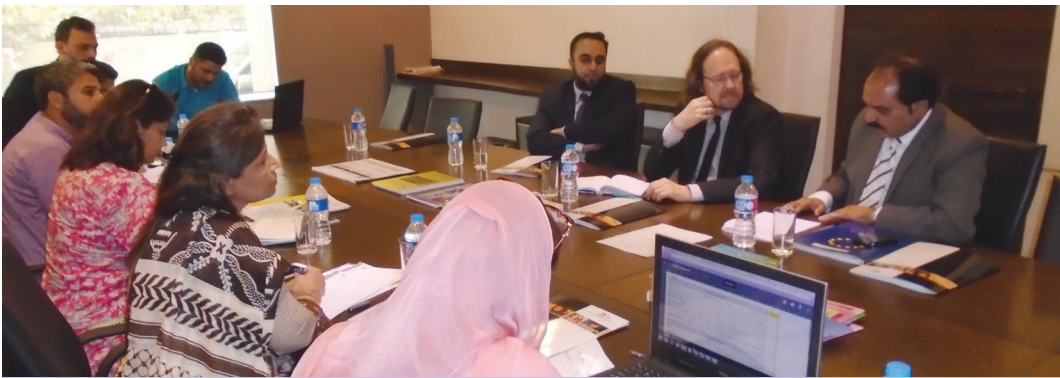
EU Mission in Meeting Hosted by Sindh Education Foundation On May 04, 2017