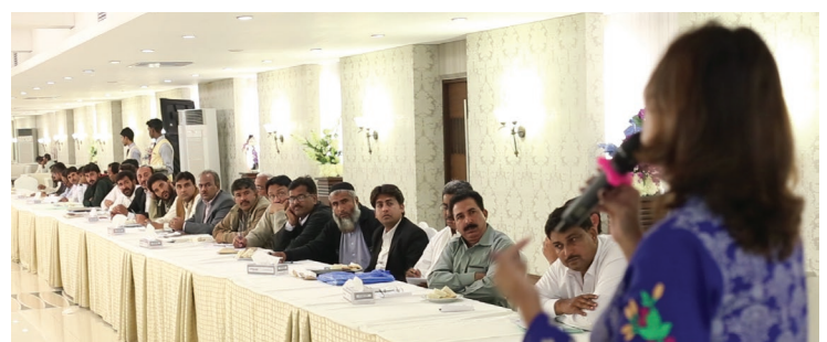
Sharing of Assessment Results with PPRS School Operators in January, 2017

The Foundation promotes transparency and sharing culture among its school operators. It not only helps to build healthy relationship between management and partners, but creates opportunities for reflection and deliberation on quality of education. Assessment results conducted by the Foundation from 2013 to 2016 were disseminated with 107 school partners from January 4 to 5, 2017 with the aim to share their achievements and areas for improvement. The Managing Director of the Foundation urged the low-performing school operators to take the Student Assessment results seriously and take appropriate steps to improve learning outcomes in their respective schools.