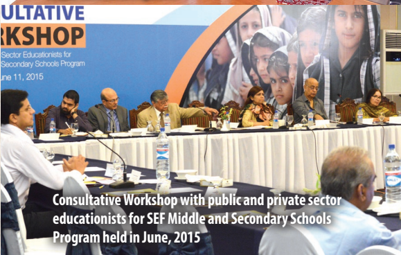
Consultative Workshop with public and private sector educationists for SEF Middle and Secondary Schools Program held in June, 2015