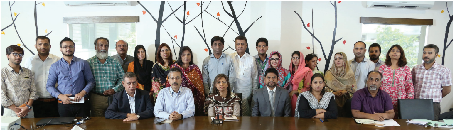
Signing of contract with Adolescent Learning and Training Program (AALTP) Partners in April, 2017

The Foundation launched 3 new programs during the period of January to June, 2017.