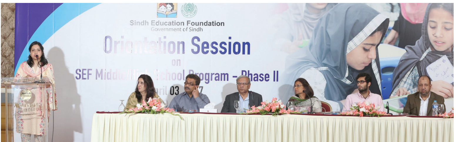
Orientation Session of SEF Middle and High School Program: Phase II in April, 2017

Under the parameters of strengthening the existing low cost private sector schools in the province, namely the Existing School Support Program (ESSP); the Foundation selected 81 schools under Phase-I for partnership after the very extensive selection process. Program was launched by the Foundation on April 7, 2017. The overall objective of ESSP is to regulate and strengthen the capacity of existing private schools and to ensure their sustainability.