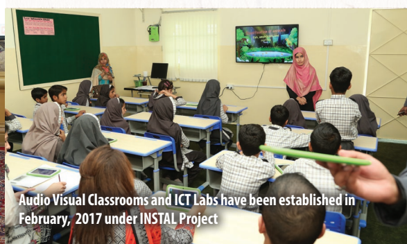
Audio Visual Classrooms and ICT Labs have been established in February, 2017 under INSTAL Project