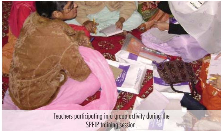
Teachers participating in a group activity during the SPEIP training session.

As part of SPEIP a comprehensive teacher development program was undertaken in an effort to provide quality assurance and institutional development support to low cost private schools. The training of Teachers was a 3-day Training titled "School Improvement and Pedagogical Excellence through Child Centered Learning and Parental Involvement". The training covered topics such as the School Improvement Plan, Child Centered Approaches, Activity Based Learning and Thematic Based Teaching on Math, English, Science and other subjects. It also included managing challenging behavior of students and preparation of a 3-month Action Plan to be implemented by the teachers after the training. The training was conducted in 8 clusters for the 297 schools under SPEIP, in which two teachers per school participated. The schools are located in 6 districts of Sindh; Karachi, Hyderabad, Dadu, Badin, Thatta and Khairpur.