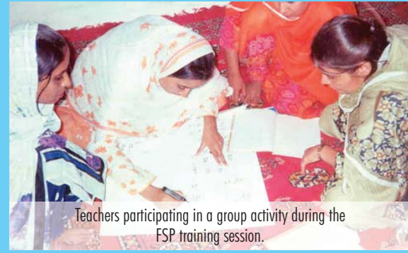
Teachers participating in a group activity during the FSP training session.

The Fellowship Schools Program organized a 3 day subject based training for 350 teachers. The training was organized in collaboration with the Parent Education Committees (PECs), which are the managing bodies of the school comprising parents and community members. The training was held in the month of July & August 2007 and focused on innovative teaching methods for a range of subjects including English, Mathematics, Science, Social Studies and local languages. The training also included sessions on classroom management, planning of annual syllabus and multi-grade teaching.